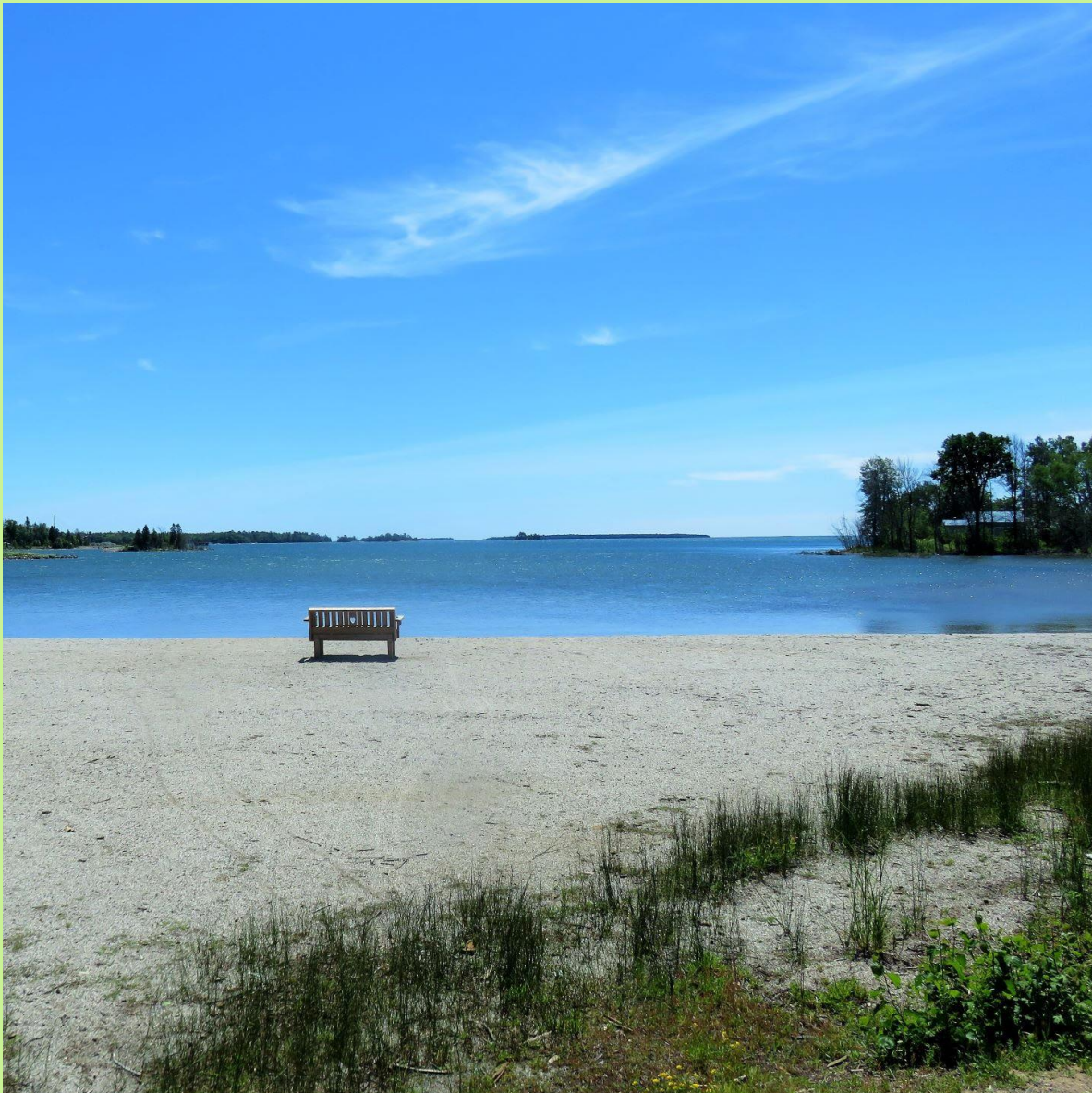
Photo - Jack's Island Beach Bruce Mines

Your annual membership fee will provide a base budget for work of CAFC and demonstrate the commitment of local partners working towards a common goal. A strong diverse group is an essential component in meeting the goals of the Central Algoma Region. Support us at https://www.centralalgomafreshwatercoalition.ca/