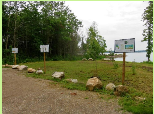
Womens Institute Park -Tarbutt Township