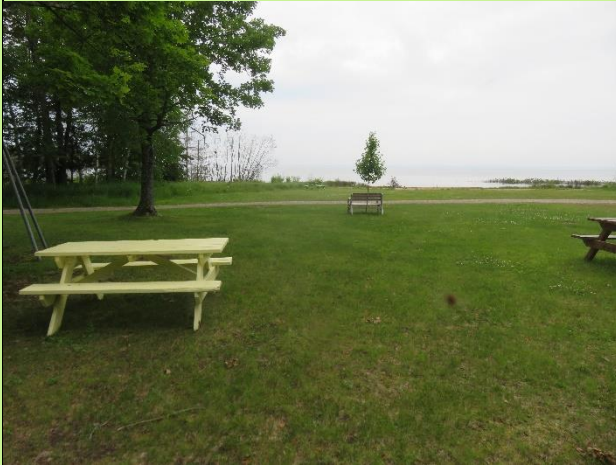
Big Point Park - Hilton Township