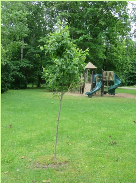
Laird Centennial Park - Laird Township